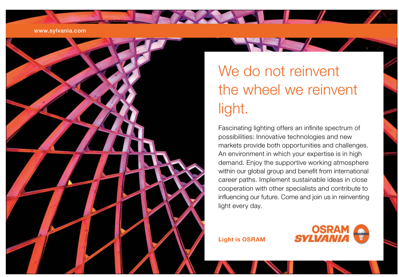
Download free eBooks at bookboon.com