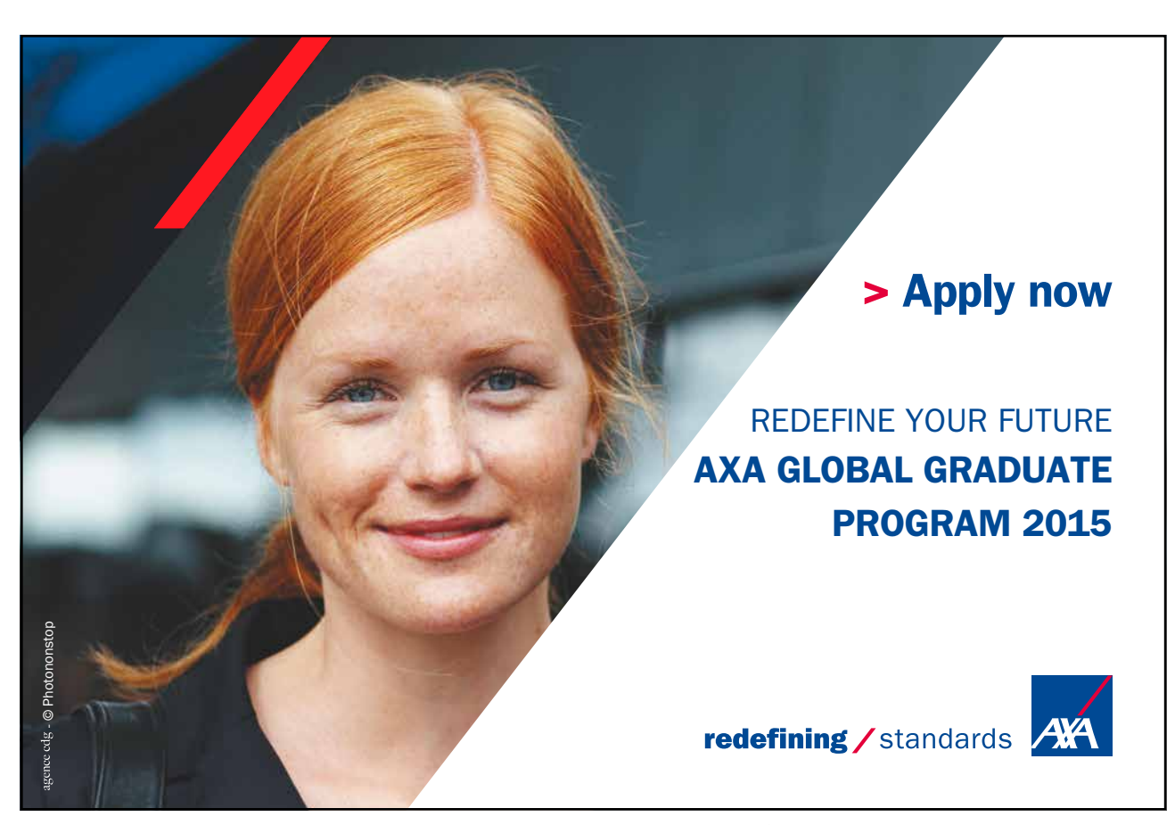
Download free eBooks at bookboon.com